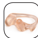
Flexible Ear Insert