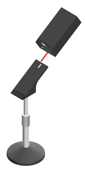
STEP #3 Place the SYSFLEX module onto the SF-MSM1 with the screw positioned in the upper hole of the dog-bone cutout. Slide the module downward so that the tab slides into the slot.