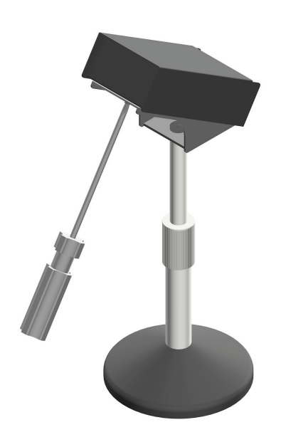
Secure the module to the mount by tightening the screw.