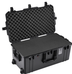
1626WF With Foam