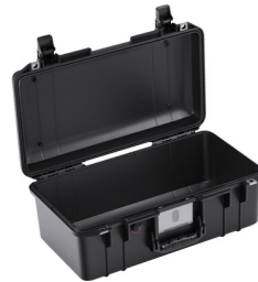
1506NF No Foam