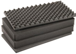
1605AirFS 4 pc. Replacement Foam Set