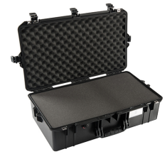
1605WF With Foam