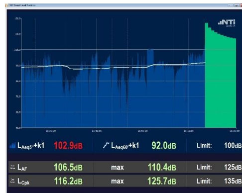
Sound Level Predictor Display

All Projector PRO settings can be saved in a software profile. For daily event monitoring such as monitoring sound levels in a local bar for example, sound level monitoring can start automatically when the host computer starts up and ends with shutdown. The XL2 sound level meter stores the measurement data for later documentation. The time of the XL2 sound level meter is automatically synchronized with the host computer allowing precise data recording. The XL2 sound level meter can then be secured remotely given the remote access via the host computer.