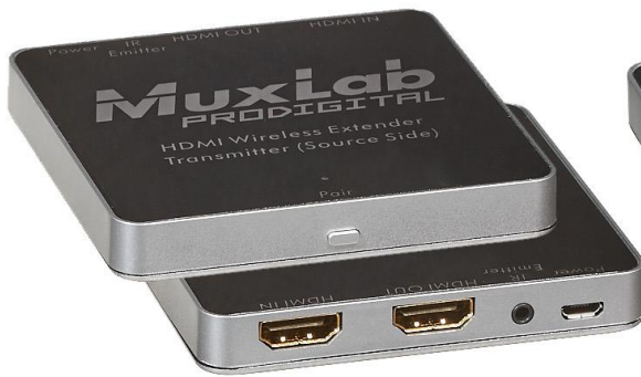
Transmitter (Source Side)