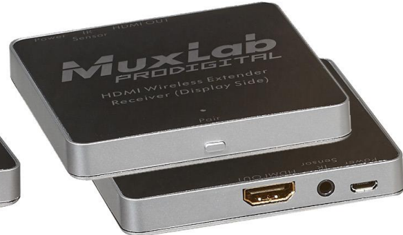
Receiver (Display Side)