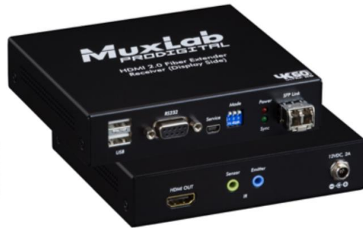
Receiver (Display Side)