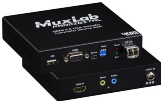
Transmitter (Source Side)