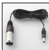
XLR 1000 Use with a standard 4 pin XLR camera battery power source