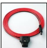
P-TAP 1000 Use with a standard battery P-TAP power source.

The kit INCLUDES AC power supplies. The power adapters below are optional.