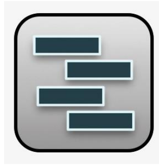
VIDEO DEINTERLACER APP

The DeInterlace Extension for the Scaler APP adds a pristine Video Deinterlacer functionality to the Scaler. It is available per processing channel.