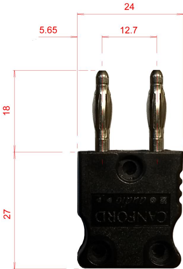
All dims in mm