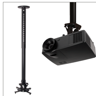
Compatible with B-Tech System 2 poles and ceiling mounts