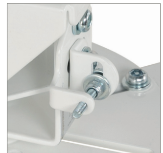
Micro-adjustment feature is ideal for short throw projectors