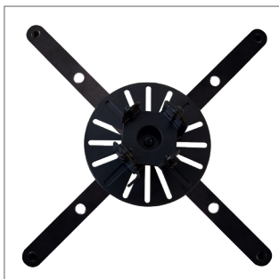
Unique 'carousel' mounting plate for universal compatibility