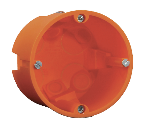
N-MODIN Helia built-in box for wall controls