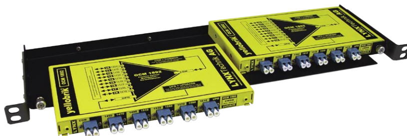
Optional RFR 1018 ½ RU 19" Rack chassis with 2 x OCM modules